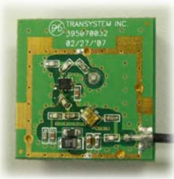
Fig-2 : LNA

For EB-270, both passive antenna and active antenna can be used. However, active antenna is recommend for optimal receiving performance. Please use active antenna with 15~20dB gain, Noise Figure less than -1.5dB.