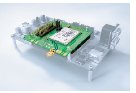
EVK2 with GE863 Interface