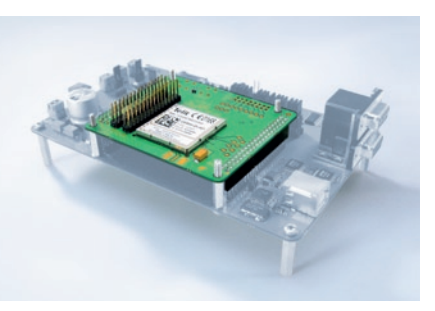
EVK2 with GE864 Interface

The Telit Evaluation Kit (EVK2) provides a robust, future-proof and flexible environment for rapid development of applications for the full range of GSM/GPRS, UMTS/HSDPA and CDMA module families, dramatically reducing time-to-market.